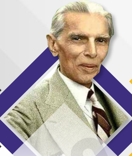
QUAID E AZAM MUHAMMAD ALI JINNAH